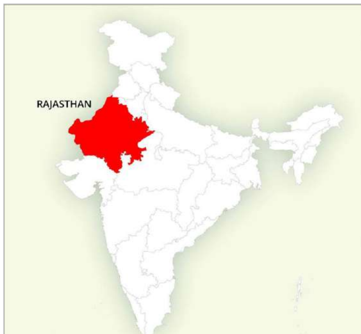
Figure 1: Rajasthan's Location

Rajasthan, in north-west India, is the largest Indian state by area, covering 342,239 square kilometres, or 10.4% of the country's total geographical area. Rajasthan's population is estimated to be 81 million, according to June 2020 Aadhaar data from the Unique Identification Authority of India.