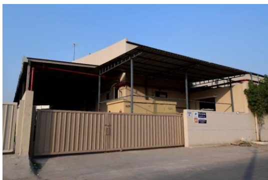
Testing lab exterior

The Mitsui Chemicals Group has previously built up a wide range of expertise relating to solar power generation. And based on this expertise, the group has fostered enough trust to be able to register a Bureau of Indian Standards (BIS)* 2 testing and certification lab before any other Japanese company. This lab will now be used for testing the performance and reliability of solar panels, allowing the Mitsui Chemicals Group to launch its business for BIS certification.