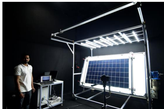
During a test